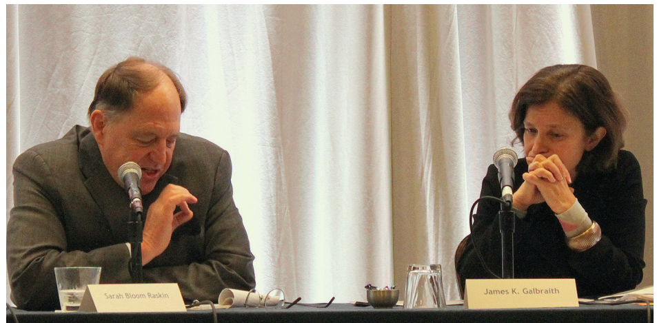
James K. Galbraith and Sarah Bloom Raskin