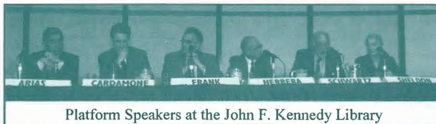
Platform Speakers at the John F. Kennedy Library

Earlier, he cautioned the audience against the cry to balance the budget by 2002, saying it and the Republican-led push for a constitutional amendment to balance the budget are political ploys and "very bad economics." And he pointed out the increasingly serious political/economic problem of the growing disparity between rich and poor, even in this country where individual wealth is unlimited in the presence of gross poverty. The barriers to peace, he said, lie not in the inadequacies of knowledge for peace building, but rather they rise from the failure to commit to a course of non-violence by limiting military production and trade. Techniques of production for necessary goods and services are available, he said. That is not the problem. The real question, he asked, is whether "we can learn to stop wasting human and natural resources, stop building weapons and build peace instead?"