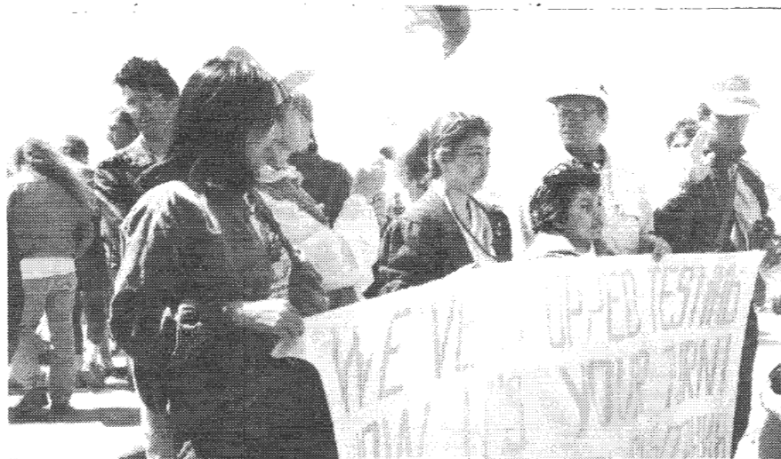
Kazakhs demonstrating at U.S. test site.

Between Friday and Sunday of Easter weekend, 761 people were arrested for civil disobedience at the test site according to a report in the