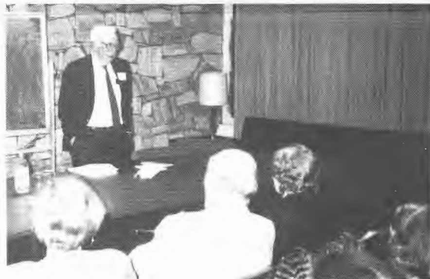
Professor James Tobin delivers talk, The State of the U.S. Economy, at New York Chapter organization meeting at Hunter College